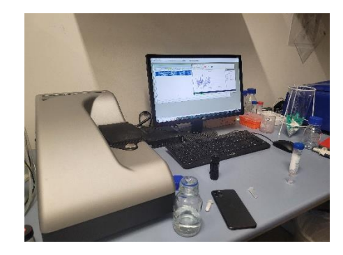
Zetasizer Nano ZSP (Malvern Panalytical Ltd.)