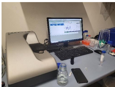
Zetasizer Nano ZSP (Malvern Panalytical Ltd.)